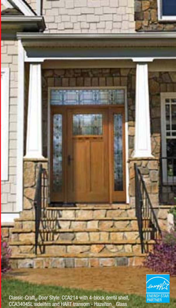
Classic-Craft® Door Style: CCA214 with 4-block dentil shelf, CCA3404SL sidelites and HART transom - Hazelton™ Glass